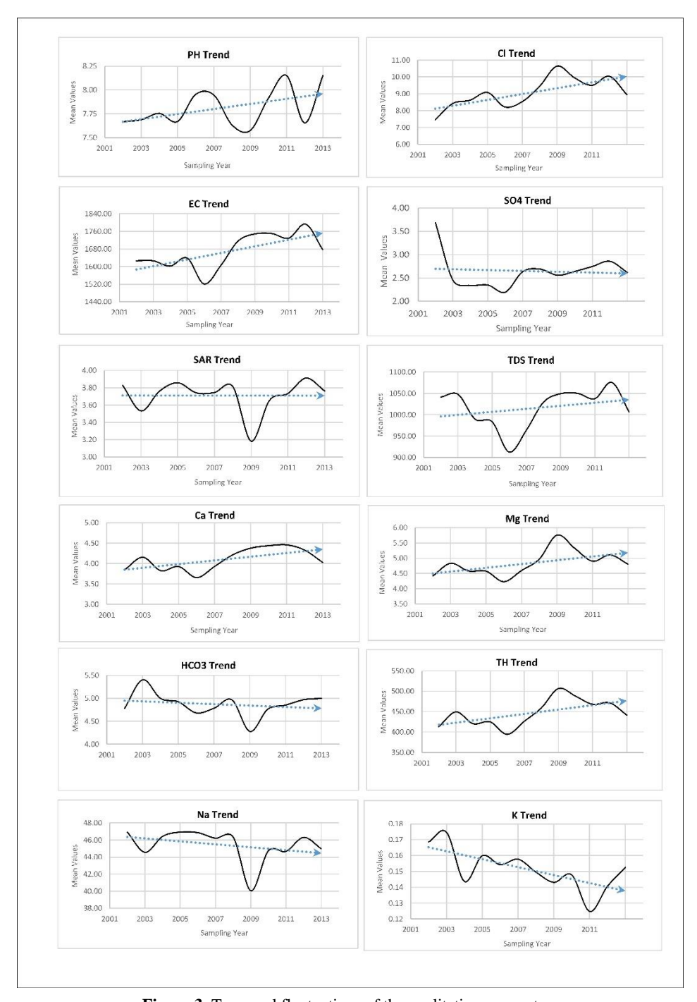
Figure 3. Temporal fluctuations of the qualitative parameters