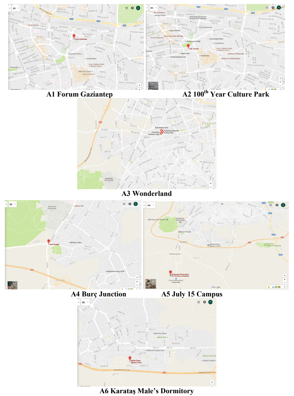
Figure 3. Bike sharing station alternatives

engineers. Alternatives are spread among the city, their common feature is that; they are all crowded and they have a strong transportation infrastructure when compared to other districts of the city. The alternatives are shown on the map in Figure 3.