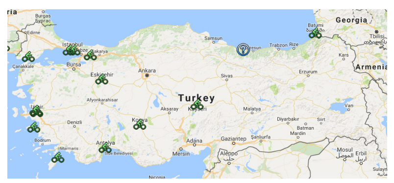
Figure 1. Bike sharing stations in Turkey [6].

decision-making me thod for determining the bike sharing station in Gaziantep. An important aspect of the city is that, the young population (15-24) in Gaziantep forms the %17.9 of the city-which is above the Turkish Republic young population ratio %16.4 [7]. The age profile of bike share users is typically younger than the general population average [8], [9]. Next section provides a review of the literature on bike sharing.