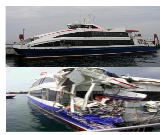
Figure 4. Results of Collision, Salih Reis 4