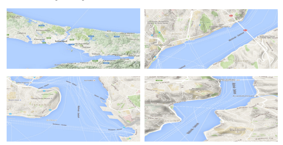
Figure 3. Istanbul Ferry Lines 3

Especially, there are lots of ferries lines at Sirkeci, Beşiktaş and Kadıköy regions. Due to traffic density, the probability of collision increases at Istanbul Ferry Lines, using the required data in this study, the relationship between accidents and density will be revealed. Images show ferries lines among these regions.