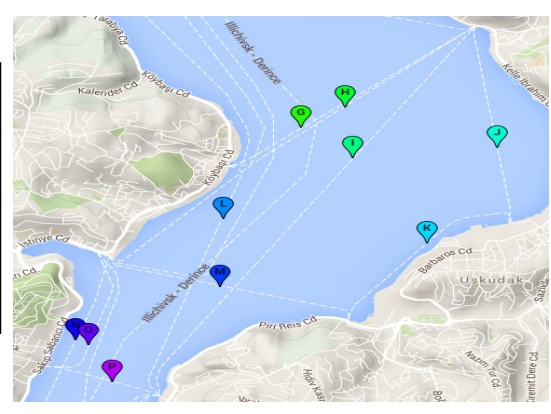
Figure 2. Istanbul Ferry Lines 2

Especially, there are lots of ferries lines at Sirkeci, Beşiktaş and Kadıköy regions. Due to traffic density, the probability of collision increases at Istanbul Ferry Lines, using the required data in this study, the relationship between accidents and density will be revealed. Images show ferries lines among these regions.