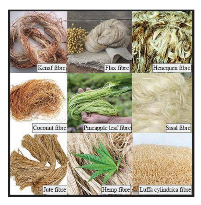
Figure 2. Natural fibers (Created by the Authors).

composites reinforced with Barkcloth<sup>1</sup> are higher than 20kJ/m<sup>2</sup>. In addition, the determination of Shore hardness (hardness of plastic or flexible materials) is 72 [33]. The results show that epoxy polymer composites reinforced with Barkcloth are suitable for interior applications in mobile spaces (floating spaces, caravans, etc.).