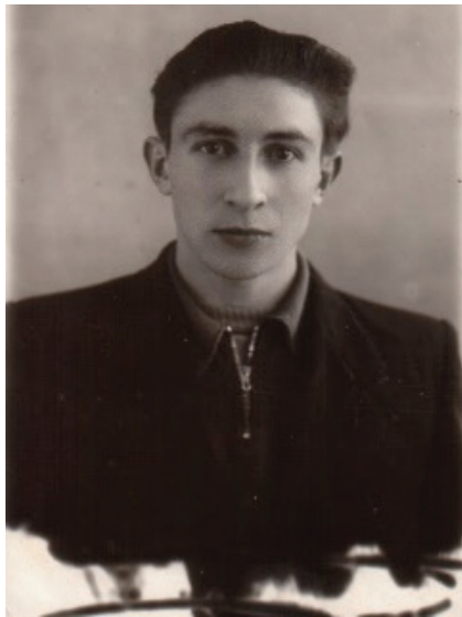
Figure 1. Baku. 1 st year. 1953.