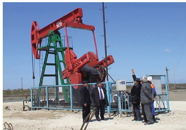
Figure 6. Implementation of the oil well monitoring system based on Noise technology at the “Shirvan Oil” oil field.