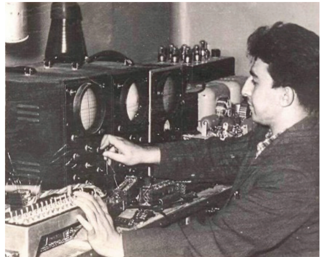
Figure 3. Working on diploma in Lviv. 1957.