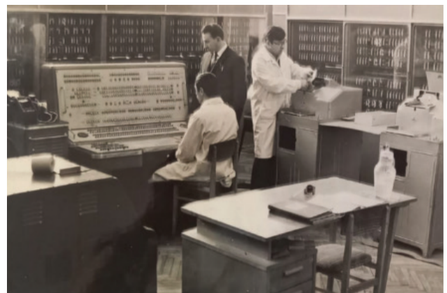
Figure 4. BESM-2 mainframe computer.