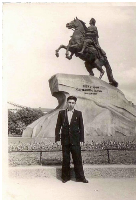
Figure 2. Work experience internship after completing the 3rd year. Leningrad. 1956.